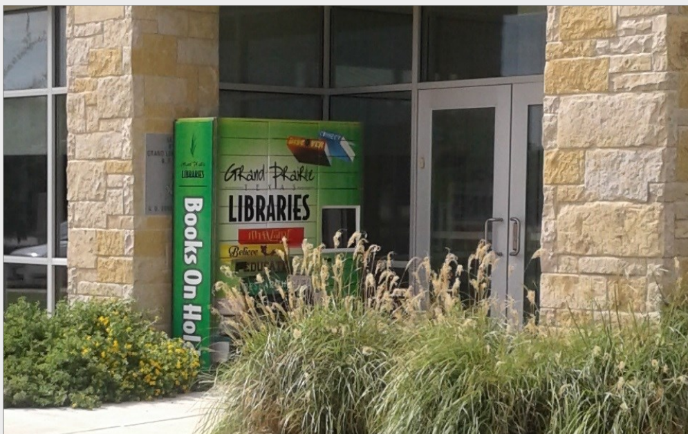
D-Tech's custom-colored, 32-bay HoldIT at the Grand Prairie Library in Texas.